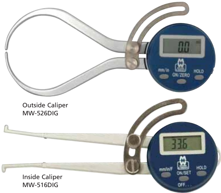
Outside Caliper MW-526DIG